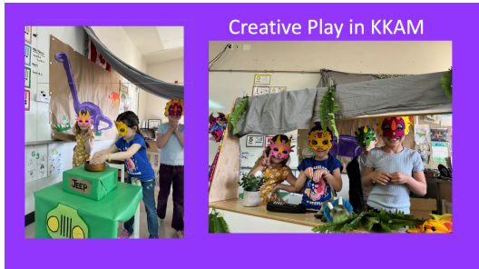
Creative Play in KKAM